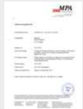
Testing report MPA Braunschweig