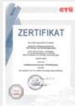
GTÜ certificate - TGA quality in building technology